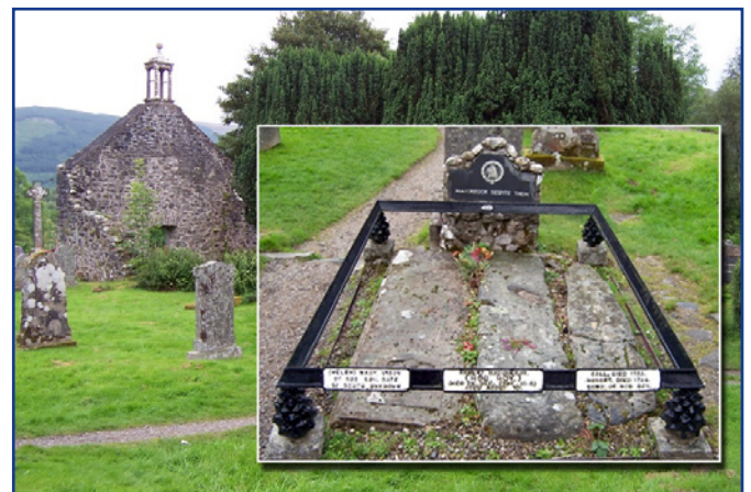
The graves of Rob Roy and his family are found in the Balquhiddier Kirkyard. The name MacGregor was once banned in Scotland.

There are other dances celebrating beautiful Balquhiddier. ( The Braes of... and A Wedding in... ). However, the Balquhiddier Strathspey (RSCDS Book 24, issued 1968) remains one of my favourites and is a welcome addition to the December Monthly Dance.