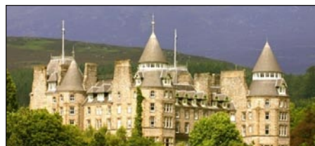
The Atholl Palace Hotel, located in the Scottish Highlands in Pitlochry, overlooks the town and wooded parkland.

Winter School dancers are accommodated in the Atholl Palace Hotel. Originally built for hydropathic cures where you could come and "take the waters", it is now a year-round resort and convention centre.