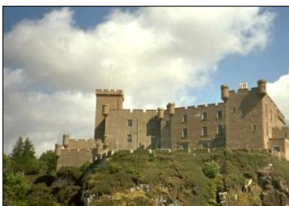
Dunvegan Castle, the ancestral home of Clan MacLeod for almost 800 years, was once surrounded by salt water.