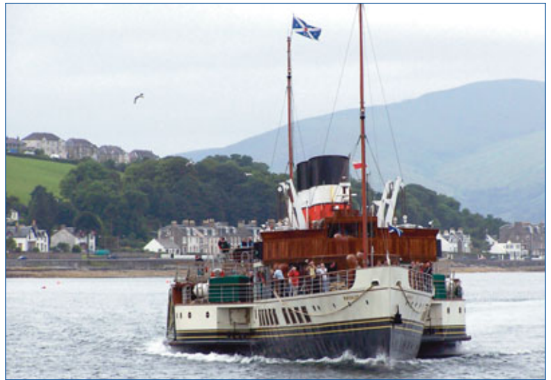
The Waverley paddle steamer departs Rothesay. Rothesay is on the eastern shore of the isle of Bute, overlooking the Firth of Clyde.

While he owns no Duchy around Bute, there has existed a Duke of Rothesay for centuries. The heir apparent to the British throne has held this additional Scottish title since