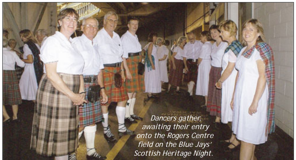
Dancers gather, awaiting their entry onto the Rogers Centre field on the Blue Jays' Scottish Heritage Night.