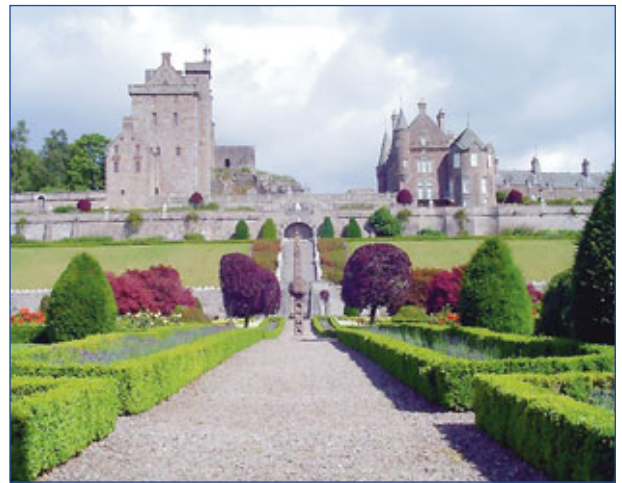
Castle Drummond, built by John, first Lord Drummond, was restored in 1890. The original keep still stands and the castle is noted for its gardens based on a 17th century Scottish Renaissance garden.