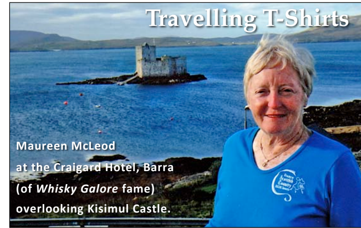
Set & Link ~ December 2012 ~ Page 5