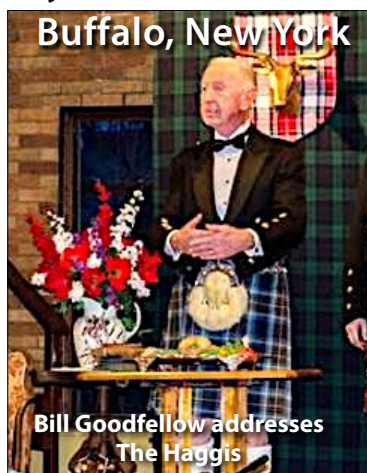
Buffalo, New York