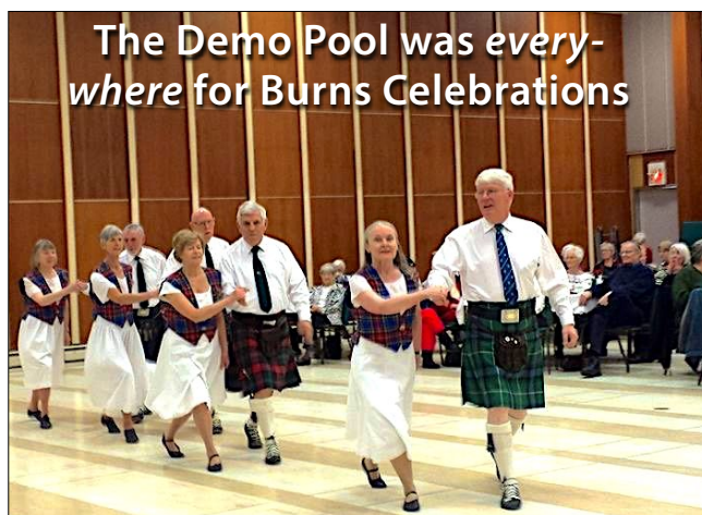
The Demo Pool was everywhere for Burns Celebrations