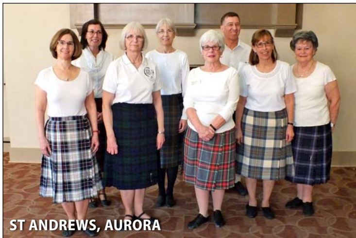
ST ANDREWS, AURORA