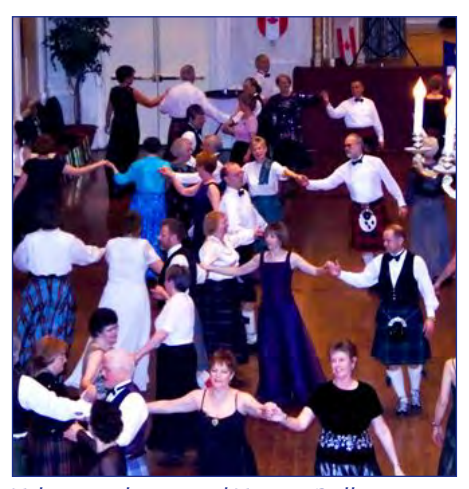
Taken at the 42nd Tartan Ball

Editor: Do you have suggestions to help inexperienced dancers learn dances ?