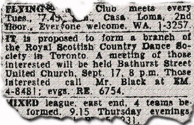
The original newspaper advertisement announcing the intention of forming a branch of the RSCDS in Toronto.

A unique feature of the Toronto Branch is that the groups formed and classes began before the Branch was established.