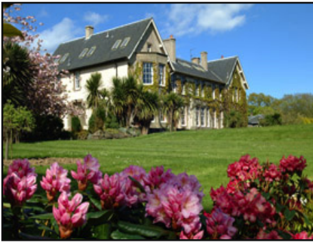
The Balgeddie House Hotel, located on the outskirts of Glenrothes, is close to the golfing shrines of St. Andrews, Glen Eagles and Carnoustie.

Just north of Kirkaldy in the Kingdom of Fife, one finds the community of Glenrothes. Currently the administrative headquarters of Fife, Glenrothes was built as “a new city” back in the 1950s to take advantage of the local coal mining industry. Not a clever move in retrospect, as the mines suffered from underground seepage and water damage, causing them to be abandoned in 1961.