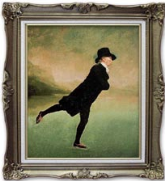
The Rev'd. Robert Walker Skating . . .