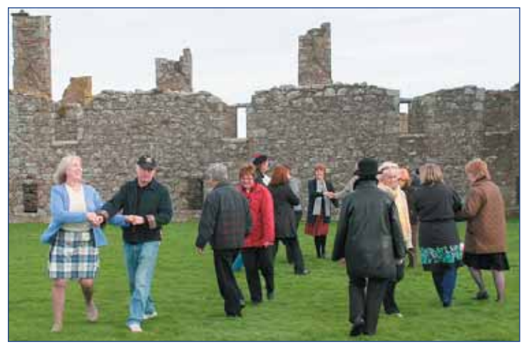
There was a wee chill in the air as we danced at Dunnottar Castle

Aberdeen, where we danced The Blooms of Bon Accord . One place we didn't dance was on the Jacobite Steam Train; we were too busy looking at the spectacular scenery.