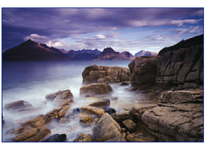
The Red Cuillins of Skye.

Unrelenting effort, considerable exposure and technical scrambling, plus abseiling and simple rock climbing are the order of the daywhen traversing The Ridge, Black Cuillins of Skye.