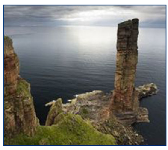
The Old Man of Hoy towers 450 feet high off the sea cliffs on the Isle of Hoy in the Orkney Islands. Orkney ferries pass here — an exciting view.

Whatever one might glean from the foregoing, that ubiquitous SCD deviser, Roy Goldring, did create a neat little jig called The Ferry Louper which one can enjoy at the upcoming March Monthly Dance.