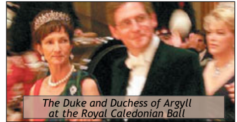
The Duke and Duchess of Argyll at the Royal Caledonian Ball

I danced Duke of Perth in 5 couple sets 10 times and it was encored numerous times. The Foursome Reel and Half Reel of Tulloch (Reeler style) are routinely followed by two sets instantly merging