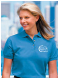
Shirts may not be exactly as shown here.

We will be selling our popular dance shirts, embroidered with our spiffy new "outreach" logo, at the November Workshop. Cash or cheque accepted. Questions? Carole Bell 416-221-1201