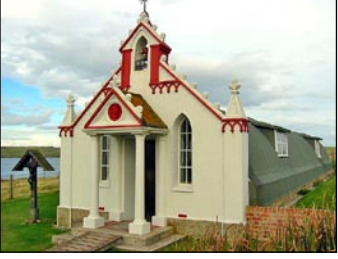
Italian POWs, captured in North Africa, were put to work in Orkney. In their rest time, they turned an ugly quonset hut into a highly ornate Catholic chapel. It's now a popular tourist site, and a category A listed building.