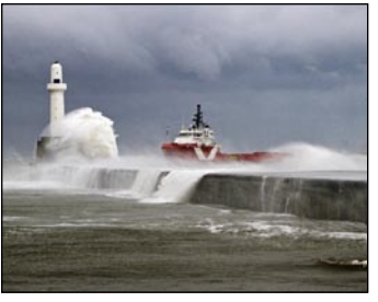
The entrance to Aberdeen harbour — on a not very nice day!