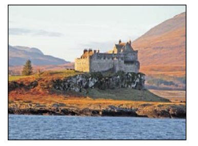
Duart Castle, from the ferry to Mull. Ancient seat of Clan MacLean.