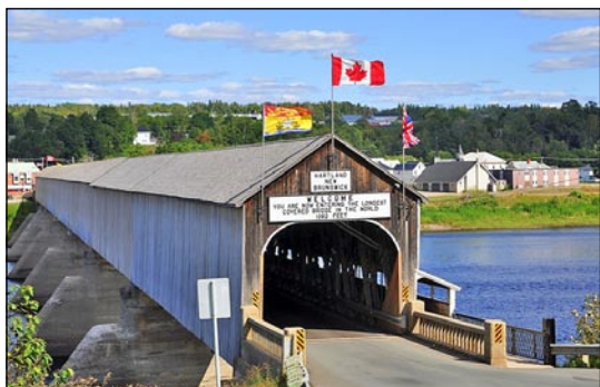
The famous longest covered bridge in the world spans the Saint John River at Hartland, NB.

It deserves its full-length spelling when we view the expansive valley through which it flows. Its headwaters rise in Maine, USA, and it runs north until curving around to reverse direction down through New Brunswick ... it flirts with la belle province , but then heads south through Canada's other bilingual province, land of the Acadians.