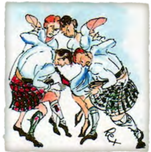
In the Rondel, the 2nd couple makes the arch.

If in doubt, ask your teacher; but, with a little thought about what comes next, you too can execute a perfect Rondel.