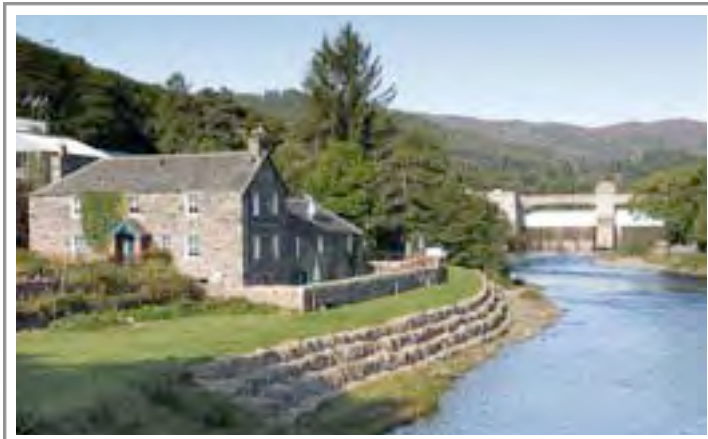
The Port Na Craig Inn beside the River Tummel was established nearly a hundred years before the battle of Culloden.