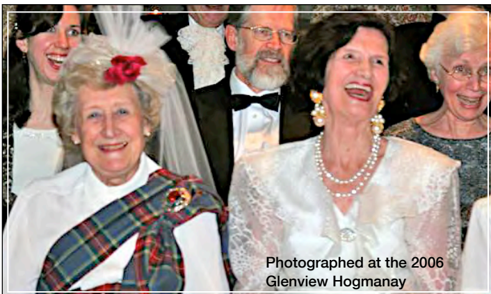
Photographed at the 2006 Glenview Hogmanay