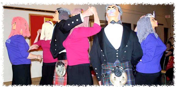
Are they dancing into 2012 or looking back to 2011?

For a schedule of new sessions, visit shiftinbobbins.webs.com. For additional information email strathspey@me.com.