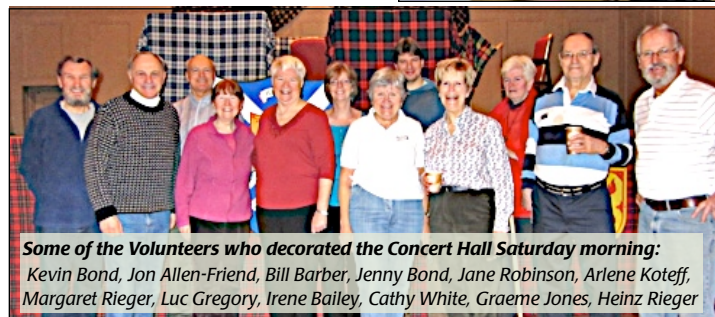
Some of the Volunteers who decorated the Concert Hall Saturday morning: