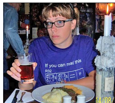
Set & Link ~ March 2012 ~ Page 3

If you and your T-shirt are travelling to an exotic location, send us a photo, tell us about the location, and we'll try to publish it.