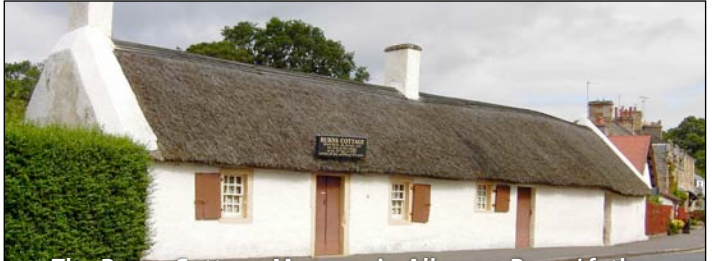
The Burns Cottage Museum in Alloway. Burns' father built this house, and Robbie lived here until age 7.

At the archives website (www.nas.gov.uk/about/090717.asp) under the heading The Legacy of Robert Burns , you can find a transcript of the birth record of Burns and see the actual handwriting of the minister in the parish record of Alloway.