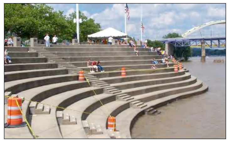
The Serpentine Wall at Yeatman's Park in Cincinnati is an undulating flood wall where the Ohio River laps against the bottom step. Serpentine walls are sometimes called crinkle crankle walls.

Participants in the April Monthly Dance will have had the enjoyment of sampling The Queen City Salute , a well-crafted 64bar medley. It is a strathspey/reel combo that concludes with a lovely formation called the Serpentine.