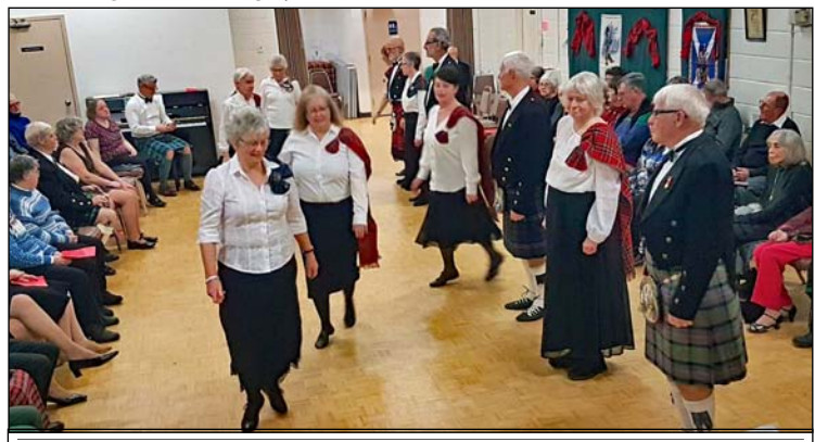
A Kindred Spirit: 32 bar Reel: 3C/4C set

We all had a good time. The evening finished with a spirited rendering of Auld Lang Syne . ... Deirdre MacCuish Bark